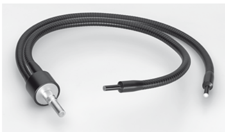
Gooseneck light guide bifurcated