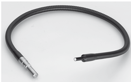
Gooseneck light guide